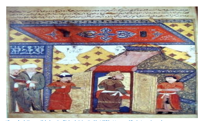
Jāme' al-Tavarikh by Rašid-al-Din Fażl-Allāh Hamadāni: Iranian documentary heritage registered on the UNESCO Memory of the World Register in 2017

Communication and Information: The priorities of Communication Information UNESCO's and programme in Iran include equitable access to information and knowledge including for persons with disabilities, capacity building of media professionals with a focus on environmental issues and science journalism for sustainable development, strengthening Media and Information Literacy competencies. Through the Memory of the World Programme, UNESCO supports preservation of, and access to, documentary heritage in Iran. Iran has 10 documentary heritage items registered on UNESCO's Memory of the World Register.