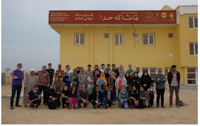
Event on the occasion of the UNESCO Global Geoparks Workshop, where stakeholders discussed the role pf youth engagement in contributing to the development of geoparks and sustainability of the local community.

UNESCO advocates for physical education and sports enablers for sustainable development. Consequently, UNESCO supports activities implemented by national and sub-regional counterparts in order to highlight the power of sports in development. UNESCO also assists cluster countries to voice and engage youth in policy-making by gathering miscellaneous stakeholders to discuss any topics of youth interest. UNESCO thus provides opportunities to young people to become actors for sustainable development in their communities.