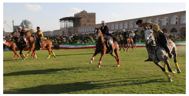
Chogān, a horse-riding game accompanied by music and storytelling, inscribed in 2017 on the Representative List of the Intangible Cultural Heritage of Humanity

Culture: At present, Iran has 23 UNESCO World Heritage Sites and 13 Intangible Cultural Heritage elements registered on UNESCO's list of Intangible Cultural Heritage . In the field of culture, the Iranian Cultural Heritage, Handicrafts and Tourism Organization (ICHHTO) is the key national partner for UNESCO, UNESCO collaborates with ICHHTO on the preservation, restoration and management of cultural heritage sites and preservation of underwater cultural heritage as well as safeguarding Intangible Cultural Heritage. UNESCO also supports ICHHTO in the fight against illicit trafficking of cultural property and sustainable tourism management.