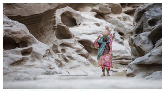
Qeshm Island UNESCO Global Geopark

(G-WADI) and the International Drought Initiative (IDI). UNESCO contributes to improve eco-system conservation and management through its "Man and Biosphere" (MAB) programme. There are currently 13 UNESCO Biosphere Reserves and 1 UNESCO Geopark in Iran. UNESCO is fully involved in the maintenance and rehabilitation of sustainable and historical underground water systems like the Qanats or Karez in the cluster countries.