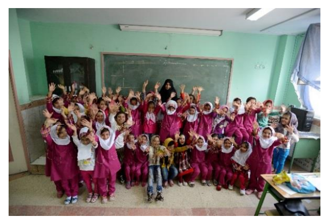
Afghan refugee children studying at school in Varamin