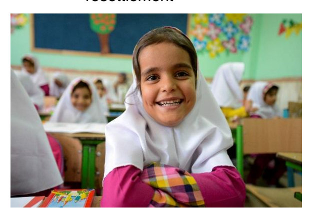
Refugees learn at school side-by-side with Iranian children.