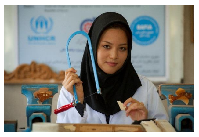
Afghan refugee participating in decorative woodwork technical and vocational training course in Varamin.