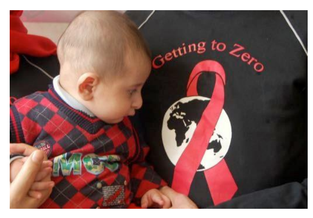
HIV-Negative child of HIV-Positive parents: Prevention of Mother to Child Transmission, Tehran Positive Club 2011.

UNAIDS is leading the global effort to end AIDS as a public health threat by 2030 as part of the Sustainable Development Goals, and ultimately to consign HIV to history.