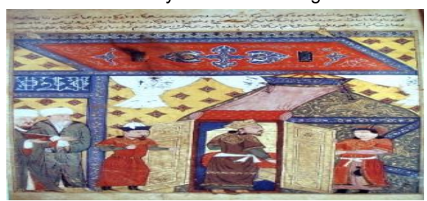
Jāme' al-Tavarikh by Rašid-al-Din Fażl-Allāh Hamadāni: Iranian documentary heritage registered on the UNESCO Memory of the World Register in 2017

Communication and Information: The priorities of UNESCO's Communication and Information programme in Iran include equitable access to information and knowledge including for persons with disabilities, awareness raising on emerging technologies such as Artificial Intelligence, capacity building of media professionals with a focus on health communication, environmental issues and science journalism for sustainable development, and strengthening Media and Information Literacy competencies. Through the Memory of the World Programme, UNESCO supports preservation of, and access to, documentary heritage in Iran. Iran has 10 documentary heritage items registered on UNESCO's Memory of the World Register.