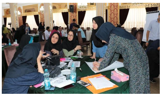
Introductory Workshop on Inclusive Approaches to Education of Children with Special Needs 2018

Education: UNESCO supports Iran in its efforts to ensure inclusive and quality education and promote lifelong learning opportunities for all in the areas of education policy, planning and strategy; disaster risk reduction and crisis-sensitive educational planning; education data collection, analysis and reporting; literacy and lifelong learning; technical and vocational education and training, and ICT in education. UNESCO contributes to the national efforts through upstream policy advice and capacity building, facilitating policy dialogues and developing partnerships. In implementing its programmes in education, UNESCO engages closely with a range of partners including the Iranian National Commission for UNESCO, the Ministry of Education, the Literacy Movement Organization (LMO) and the Technical and Vocational Training Organization (TVTO) under the Ministry of Cooperatives, Labour and Social Welfare and UNICEF.