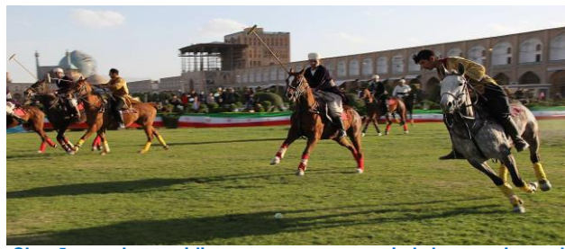
Chogān, a horse-riding game accompanied by music and storytelling, inscribed in 2017 on the Representative List of the Intangible Cultural Heritage of Humanity

Culture: At present, Iran has 24 UNESCO World Heritage Sites and 14 Intangible Cultural Heritage elements registered on UNESCO's list of Intangible Cultural Heritage. In the field of culture, the Ministry of Cultural Heritage Tourism and Hanicrafts (MCHTH) is the key national partner for UNESCO. UNESCO collaborates with MCHTH on the preservation, restoration and management of cultural heritage sites and preservation of underwater cultural heritage as well as safeguarding Intangible Cultural Heritage. UNESCO also supports MCHTH in the fight against illicit trafficking of cultural property, museum management as well as sustainable tourism management.