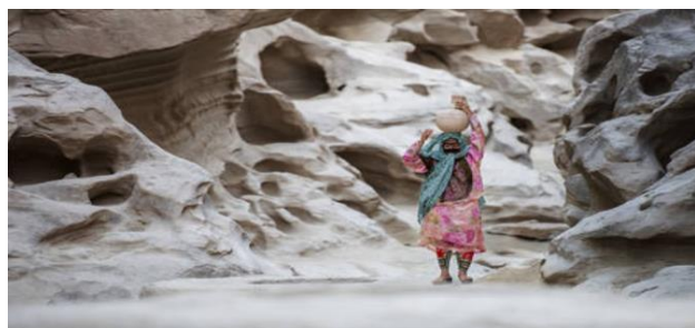
Qeshm Island UNESCO Global Geopark

UNESCO contributes to improve eco-system conservation and management through its "Man and Biosphere" (MAB) programme. There are currently 13 UNESCO Biosphere Reserves and 1 UNESCO Geopark in Iran. UNESCO is fully involved in the maintenance and rehabilitation of sustainable and historical underground water systems like the Qanats or Karez in the cluster countries.