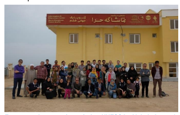
Event on the occasion of the UNESCO Global Geoparks Workshop, where stakeholders discussed the role pf youth engagement in contributing to the development of geoparks and sustainability of the local community.

UNESCO advocates for physical education and sports as enablers for sustainable development. Consequently, UNESCO supports and sub-regional counterparts in order to highlight the power of sports in development. UNESCO also assists cluster countries to voice and engage youth in by gathering policy-making miscellaneous stakeholders to discuss any topics of youth interest. UNESCO thus provides opportunities to young people to become actors for sustainable development in their communities.